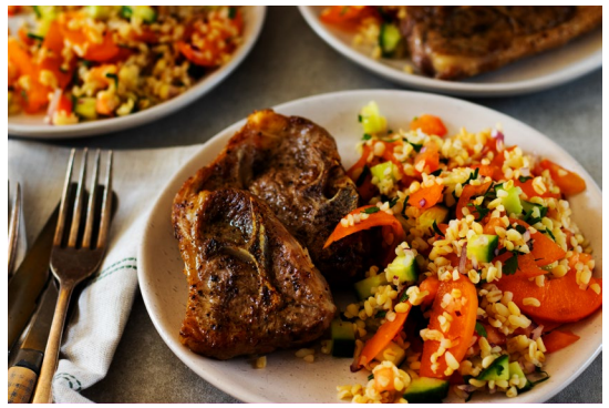
Recipe made using bulghur wheat as an alternative