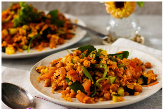
Recipe made using bulghur wheat as an alternative